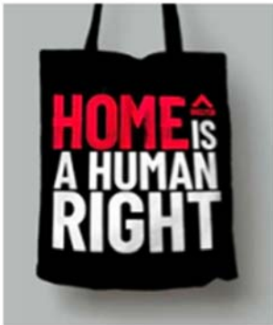
Tote Bag - Home Is A Human Right