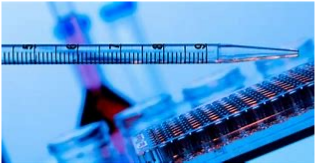
From France genomique 2025

Since 2006, new technologies have made it possible to discover the properties of many bacterial species in these ecosystems