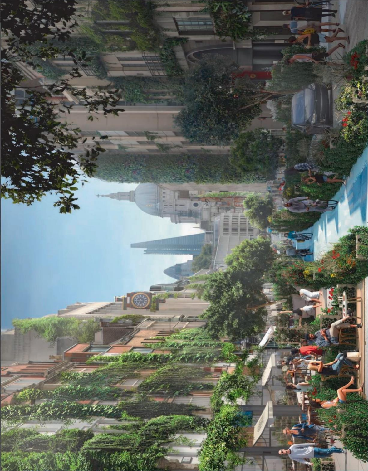
Wimberly, Allison, Tong & Go, www.watg.com (architectural firm), 10 October 2017